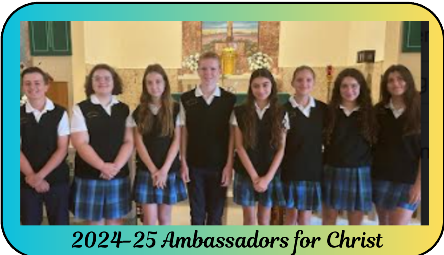
2024-25 Ambassadors for Christ