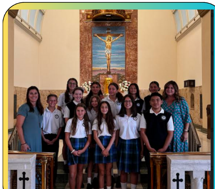
2024-25 Student Council